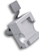
Universal specimen clamp