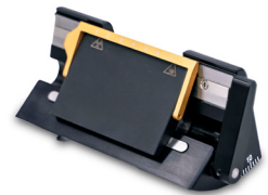
Knife carrier ME