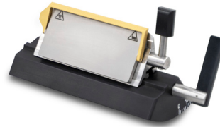
Knife carrier MR