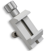
Standard specimen clamp